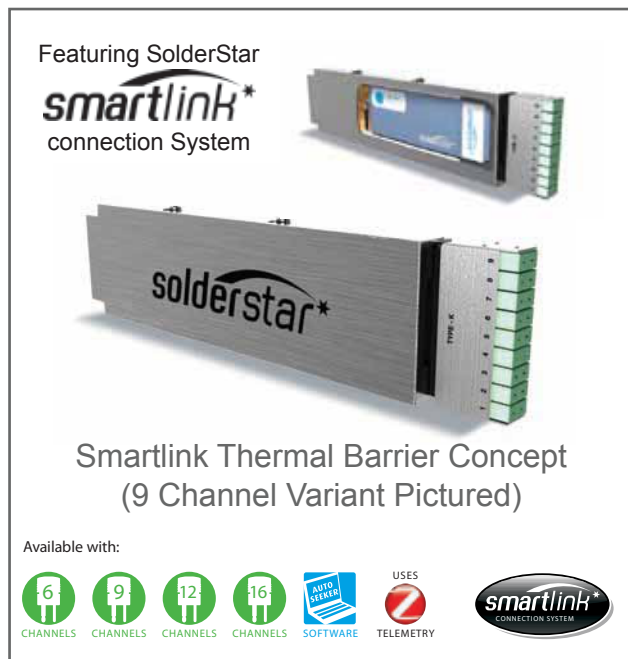
Miniature Profiling Datalogger